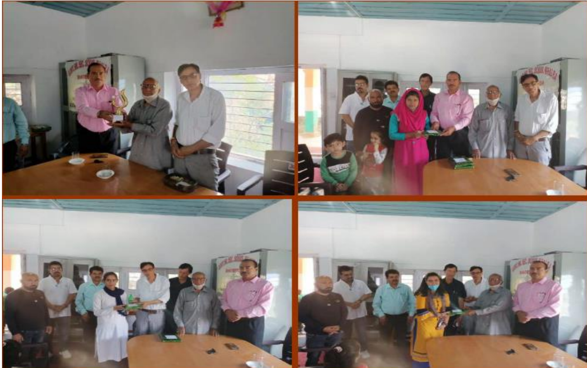
Community Mobilisation Programme with SMCs Members

Timely virtual meetings with parents were conducted to get feedback from parents regarding the studies of their children. Virtual meets were organized with the SMCs and senior citizens to seek their cooperation in carrying out teaching-learning during the pandemic time.